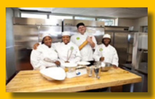
Students of the Culinary Arts program at Bishop State Community College